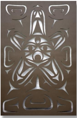
Flip through the brochure to view all of the available screens.

Add West Coast history and culture to your home, business, and commercial or public building with this stunning line of decorative screens,. All screens are designed to last in BC's rugged climate and are also suitable for indoor use.