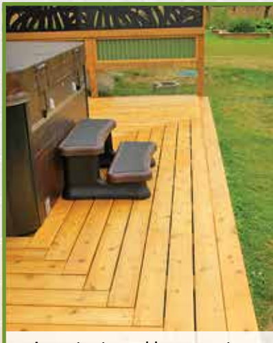
An option is to add an attractive wood surface on top of the hot tub foundation. Multiple Foundation Kits allow you to extend your deck area.