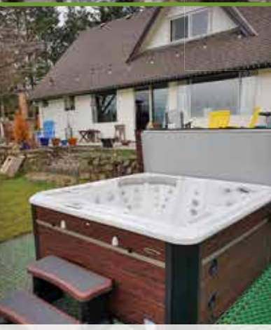
Your hot tub can be positioned directly on the hot tub foundation.

The Stength is in the aggregate filled CORE Foundation.