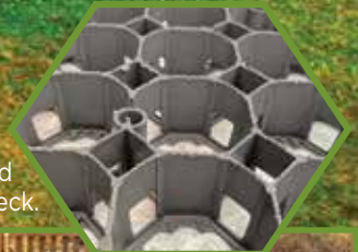
Detail of the Foundation Grid below the wood deck.