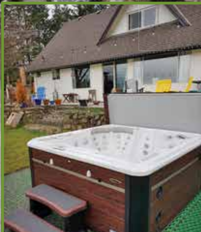
Your hot tub can be positioned directly on the hot tub foundation.