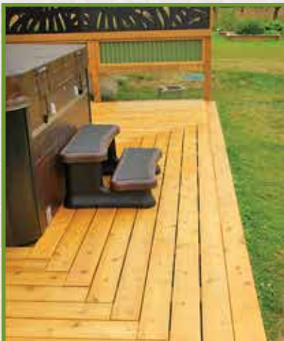
An option is to add an attractive wood surface on top of the hot tub foundation. Multiple Foundation Kits allow you to extend your deck area.

The Strength is in the aggregate filled CORE Foundation.