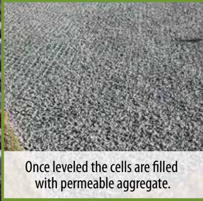
Once leveled the cells are filled with permeable aggregate.